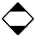
Limited Quantity Ground